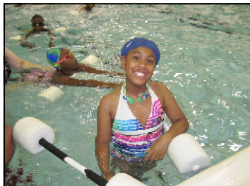
3rd and 4th graders went to the YMCA for swimming lessons.