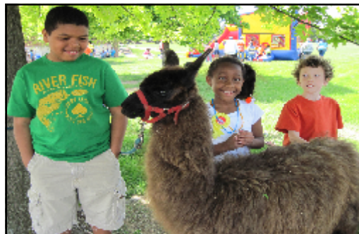
Spring Fling in May.