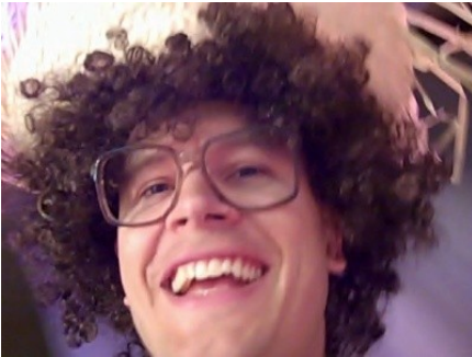
Pastor as "Sailor Jack"